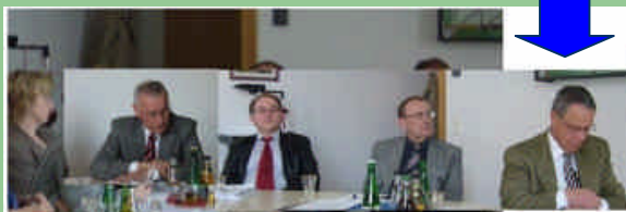
Gründung Entwicklungsforum Elbe-Elster